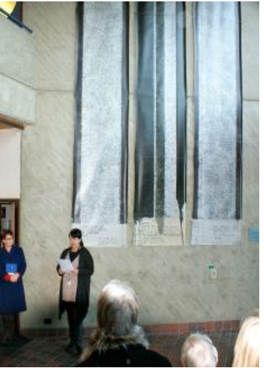
Hotere's 'Rain' banner was restored and a copy was then hung at the University in 2013, with the help of a $3,000 donation from U3A Dunedin.

The English Department received $640 in 2011 to purchase Green's Dictionary of Slang for the University Library, and $1,700 went to the